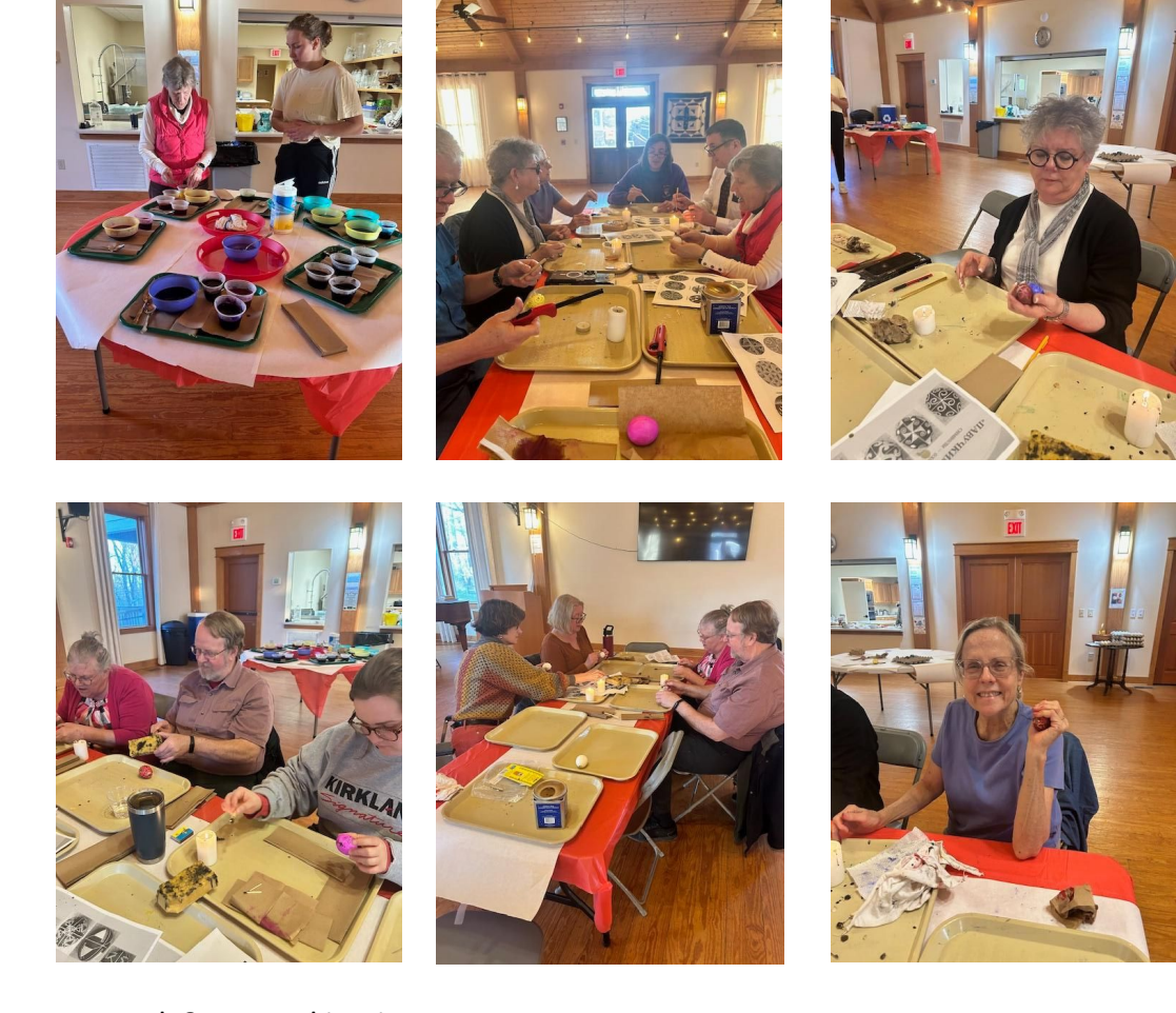
St. Mark & St. Paul in Pictures